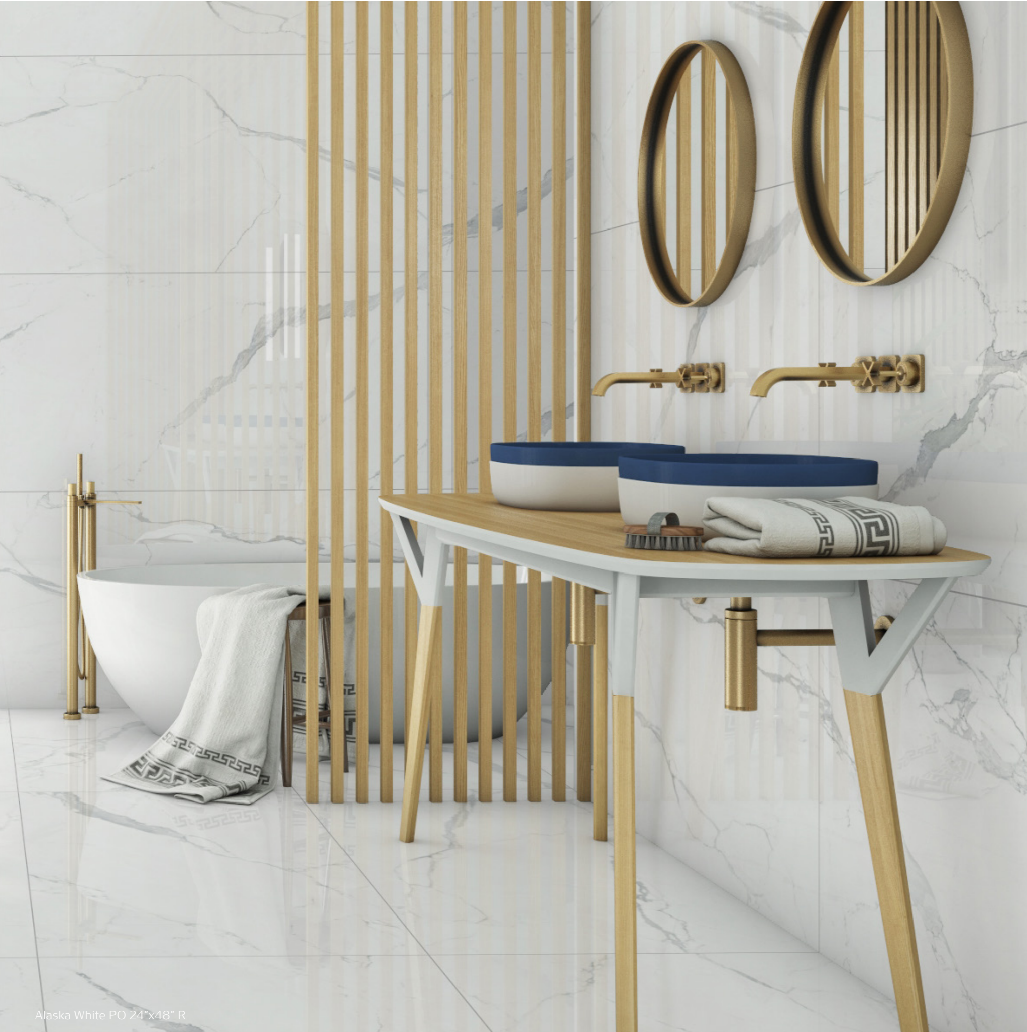
Alaska White PO 24"x48" R

The Alaska White boasts graceful gray veining which give rise to interesting contrasts between its delicate veins and its homogeneous white base, making it a perfect ally for interior design.